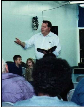
Our Very First Chapel Service: June 1999

Here at the Mission, we cannot believe we are celebrating our 25th Thanksgiving Dinner here on Cranston Street. God has truly blessed us and enabled us to touch more lives than we could possibly imagine! While our numbers have drastically grown (our first holiday meal served around 15 people!), the heart of the ministry is exactly the same: to reach the poor and homeless of our community with the love of Christ. In honor of our 25th anniversary, I would like to personally invite you to partner with us this Thanksgiving. Just $2.39 can provide a hot, homemade meal to a neighbor in need. Just $40 can provide a family of four with a 40lb. food basket. Thank you for coming alongside us to leave an amazing legacy of giving in our community! God Bless!